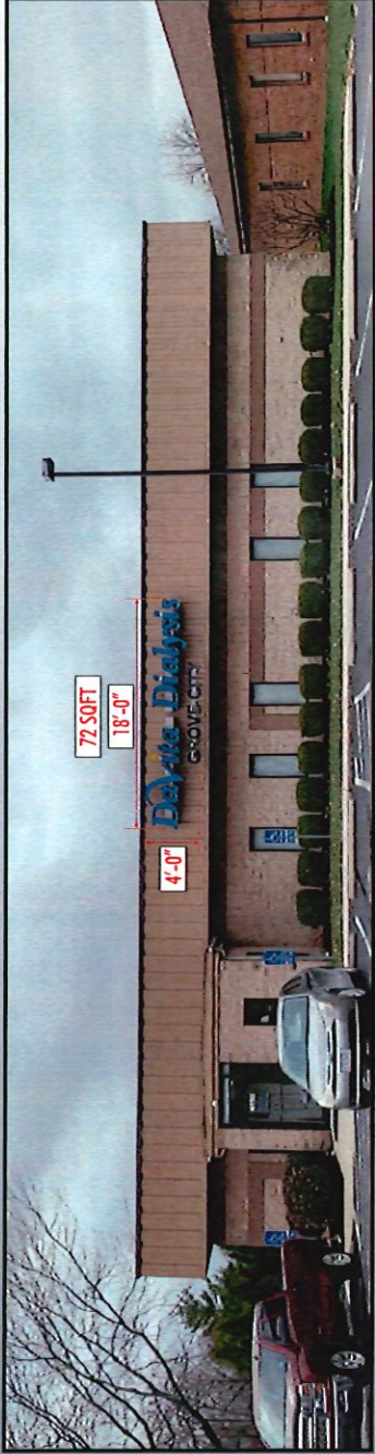
PROPOSED CONCEPTUAL: SCALE: 3/32" = 1'-0"