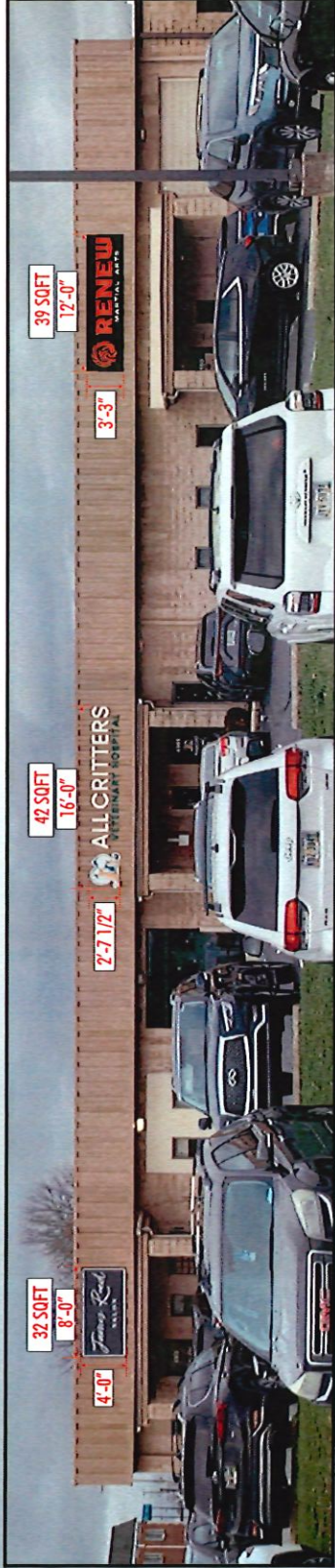
PROPOSED CONCEPTUAL: SCALE: 3/32" = 1'-0"

SCALE AS NOTED SCALE: 0/1 DESIGNER: BM This product is an original unpublished design. All rights reserved. No part of this publication may be reproduced, stored in a retrieval system, or transmitted in any form or by any means, electronic, mechanical, photocopying, recording, or by any information storage and retrieval system, without the prior written permission of DaNite Sign Company. The use of any part herein for manufacturing, sale or distribution of other products by unauthorized parties constitutes an infringement.